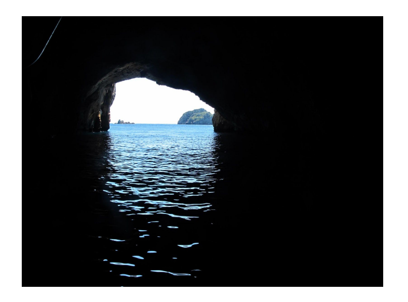
Riko-Riko Cave, Poor Knights

Quite a few years later when I was in the Maldives, and a couple of days after taking on the job of "Dive Base Leader" at one of the atolls, I was advised that divers often go missing and if that happened on my watch, to do a runner as soon as possible. Ever had hairs stand up on the back of your neck? A week later, on another atoll, two instructors did disappear, one within an hour of the other. They went down to release a stuck anchor. The first didn't come back so the other followed, also doing the same magic trick.